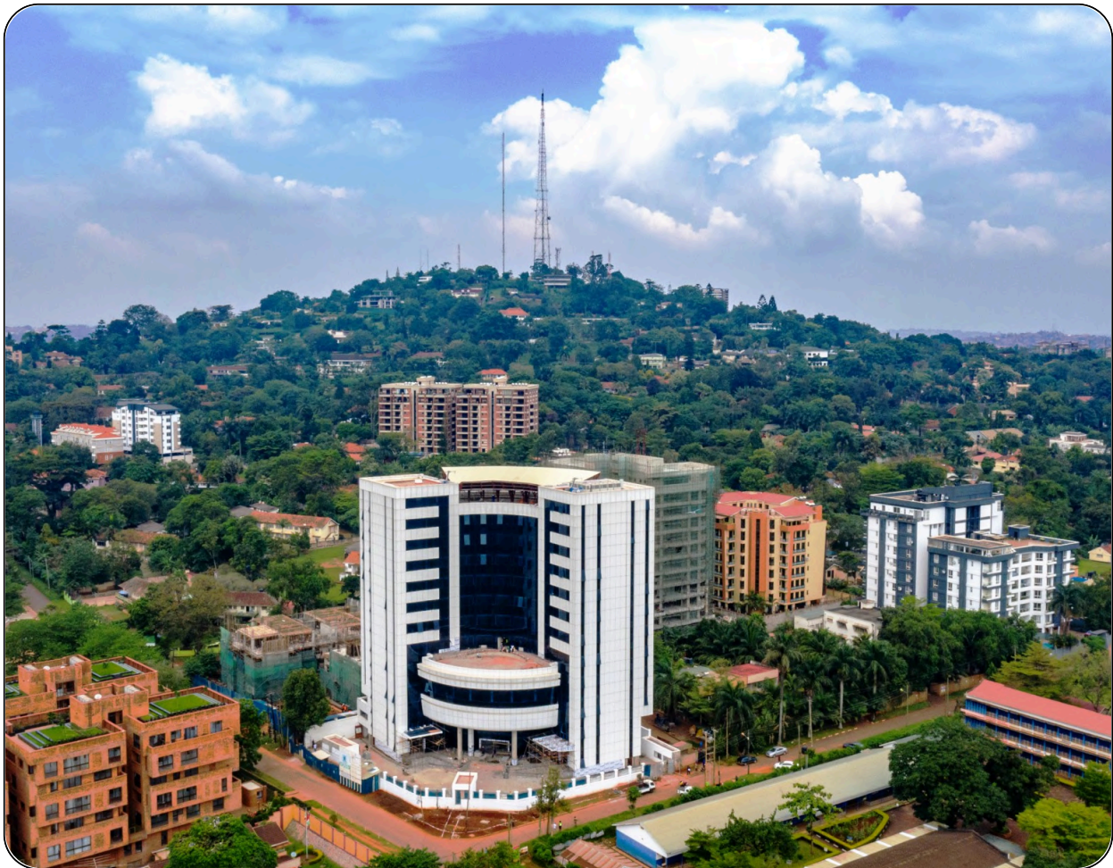
The Capital Markets Authority (CMA) headquarters in Kampala

When you buy a bond, you are lending money to a company or the government. They promise to pay you back with interest on an agreed future date. Government bonds in Uganda currently pay interest of 14–18% per year.